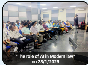
"The role of AI in Modern law" on 23/1/2025