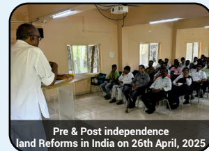
Pre & Post independence land Reforms in India on 26th April, 2025