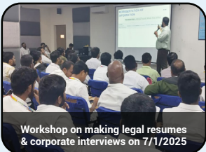
Workshop on making legal resumes & corporate interviews on 7/1/2025