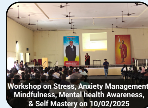
Workshop on Stress, Anxiety Management, Mindfulness, Mental health Awareness, & Self Mastery on 10/02/2025