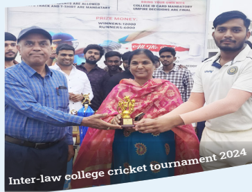
Inter-law college cricket tournament 2024