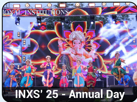
INXS' 25 - Annual Day

The hands-on experience of teaching staff both in industry and practice enables the students to learn legal concepts in a quicker, easier, more effective, and more efficient manner. Spread over a sprawling campus of over 18 acres, the law college provides state-of-the-art infrastructure in terms of its sports facilities and library, which is the largest in area with higher reference books, making it the most sought-after place on the campus. The Law College remains well connected through the different nooks and corners of the city through its wide reach of transport facilities and also provides for on-campus hostel facilities, keeping it focused on the holistic development of the student's career. Under its Clinical Legal Education initiatives, BLC has been conducting various free legal aid, intra-college moot court competitions, legal awareness, and prison visit programs, providing the students with on-the-field exposure to the legal concepts.